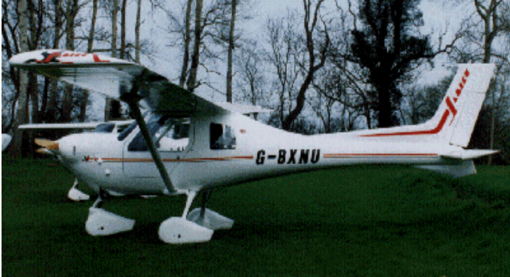
Photo of G-BXNU with two bladed propeller installed.