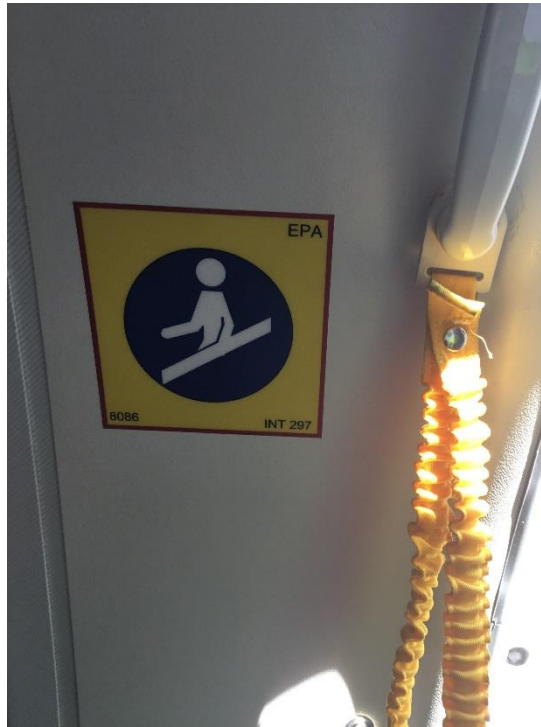
Illustration 4: Door frame of the Boeing 737-8AS aircraft with registration EI-EVE