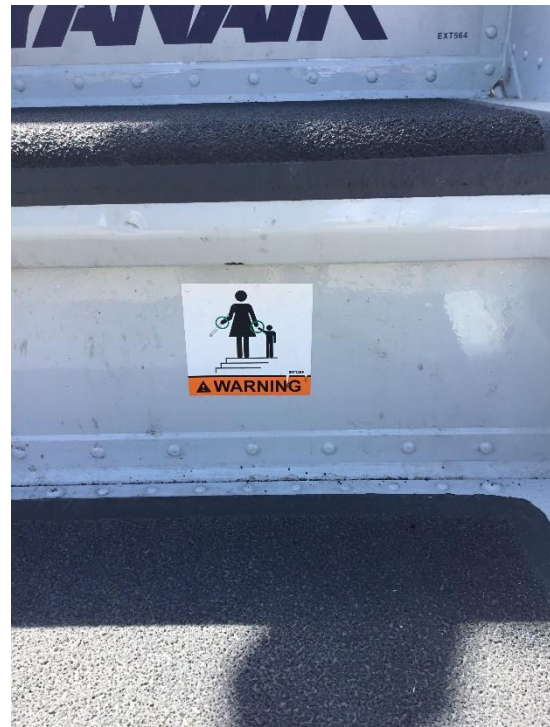
Illustration 2: Stairs of the Boeing 737- 8AS aircraft with registration EI-EVE

These warning signs also advised holding onto the handrail with the other hand.