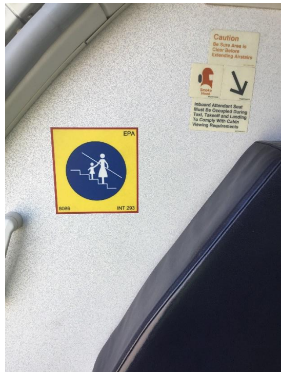
Illustration 3: Door frame of the Boeing 737-8AS aircraft with registration EI-EVE

In addition, there was another warning sign on the door frame advising passengers to hold