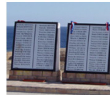
Sharm el-Sheikh accident memorial (January 2004)